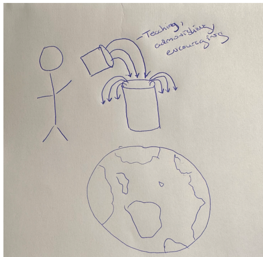
Illustration: Fullness in Christ

We continually proclaim Christ, admonish, teach, and encourage. Not only does this fill others up so they are complete in Christ, the overflow shows the world their reflection of Christ. This is what we mean by being “complete in Christ.” One is both filled with the fullness of Christ and reflecting Christ to the world around.