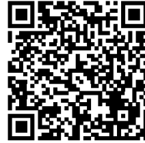
IPC All-Church Retreat