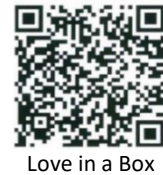
Love in a Box

It isn't too late to join in - empty boxes with full instructions and packing list, are still available. If you are unable to prepare a box, perhaps you could contribute to the costs of a box. Use the cash donation box or the Twint QR code.