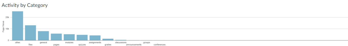
The analytics page of our online campus. Too many students for too few teachers

We finished the year very tired, but with a lot of enthusiasm for all that God is doing through us. Our future plans are only tentative due to the uncertainty of travel and necessary quarantines in different countries. We ask that you continue to pray for us and for the opportunities that God gives us to build His kingdom. We always pray for you, thanking God for your lives and asking that He will reward you greatly now and in glory as you continue to invest in missions. You are in our hearts all the time, and much more now, with Thanksgiving approaching.