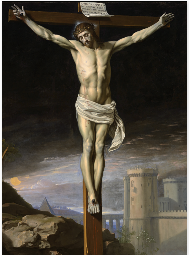
Christ on the Cross , ca. 1655 ( Le Christ sur la croix ; Crucifixion ; Le Christ mort en croix ), Philippe de Champaigne, French, Oil on canvas

(Paraphrased from Nelson-Atkins catalogue entry)