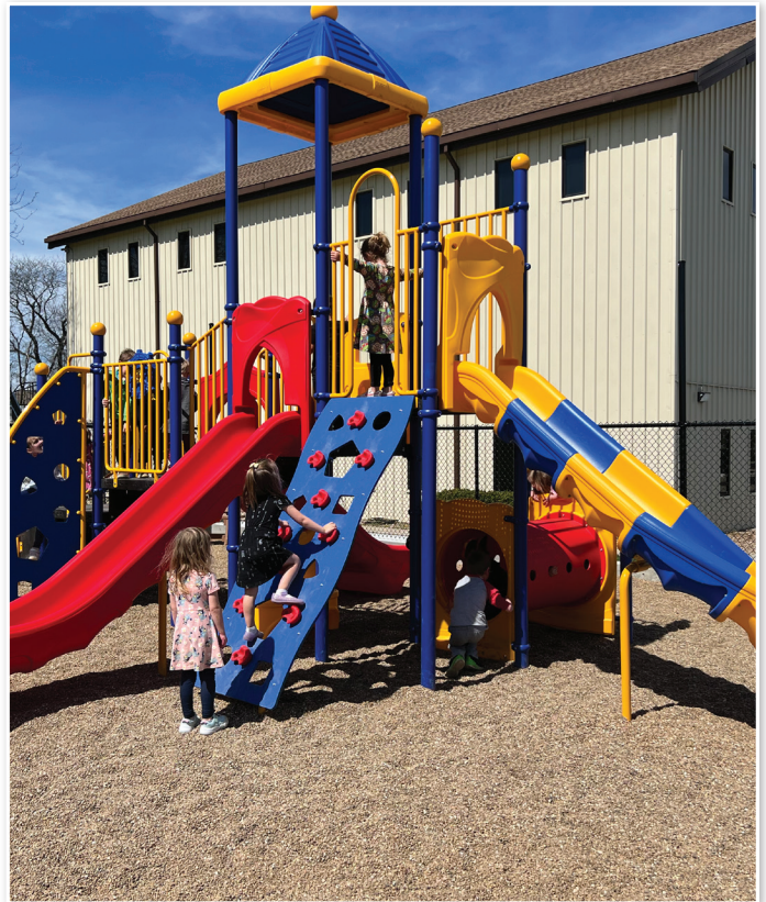
Students at the Early Learning Center love climbing and playing on their new playground equipment just recently installed.

Saint Paul Lutheran High School's Servants of the Saints are having their Spring Rummage Sale April 17-20. This is a great sale to purchase adult and children's clothing, shoes, toys, home goods, tools, antiques, books and more at great prices. The sale is located in Weis Gym Annex at 205 S. Main Street, Concordia, MO.