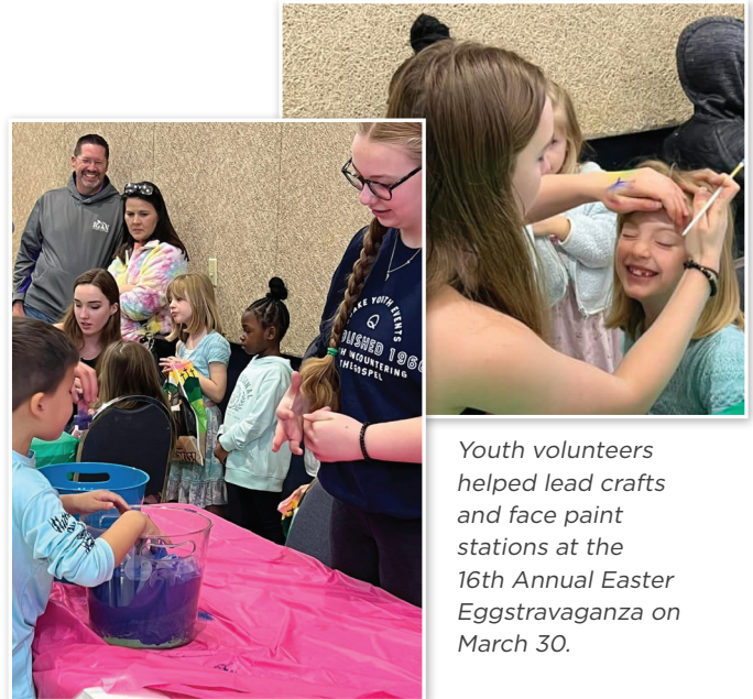
Youth volunteers helped lead crafts and face paint stations at the 16th Annual Easter Eggstravaganza on March 30.