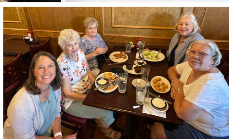
LWML ladies enjoyed the company of friends and fellowship at Smokehouse BBQ on July 11 for the annual Ladies Night Out