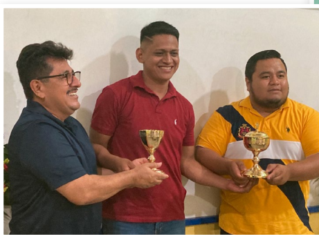
Pastors receiving new communionware