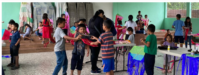
Making kites at the Los Limones church plant