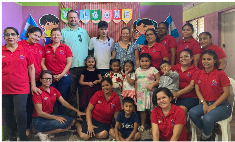
Gualán Compassion center staff and King of Kings sponsored children