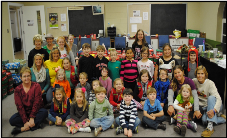
AWANA LOVES SHOEBOXES!