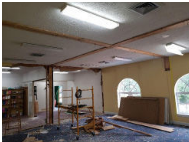
New floors coming soon!