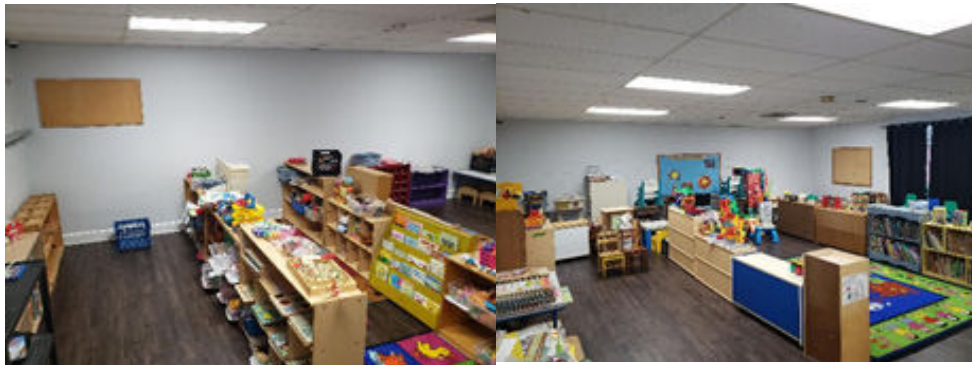
Your future Children's large group worship room!