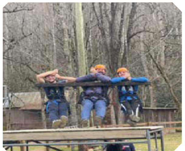
Three Man Swing?!