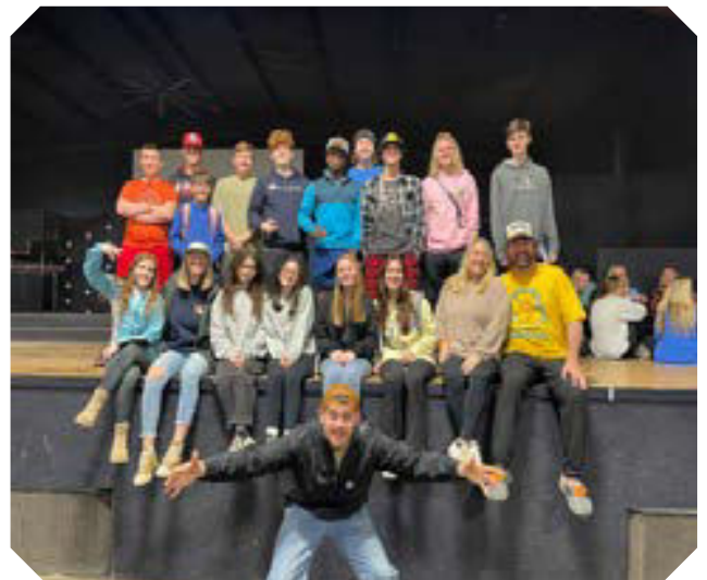
"Our LBC Group"

Blessings to you all, let's make March a month filled with joy, community, and thanksgiving!