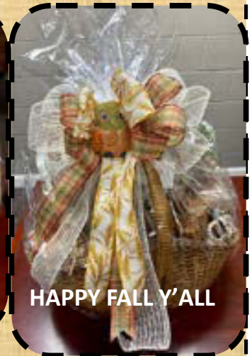
HAPPY FALL Y'ALL