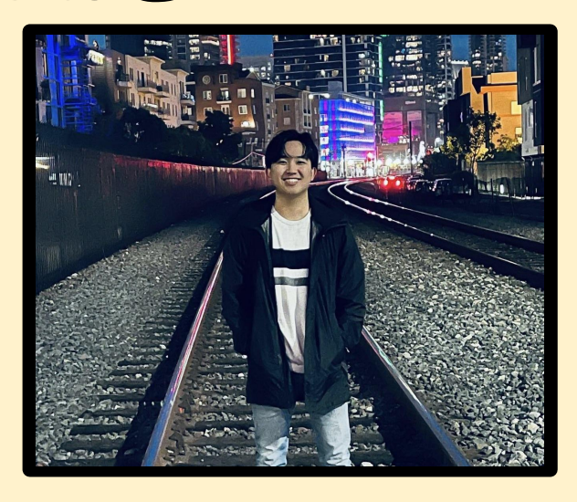
Figure skating, exploring new pieces of literature, writing articles 3 of my favorite things: My two cats, Barnes & Nobles, working out I'm in LH Kids because: I love to help teach the kids and get to know them better!

Birthday: June 12, 2007 Hobbies/Interests: