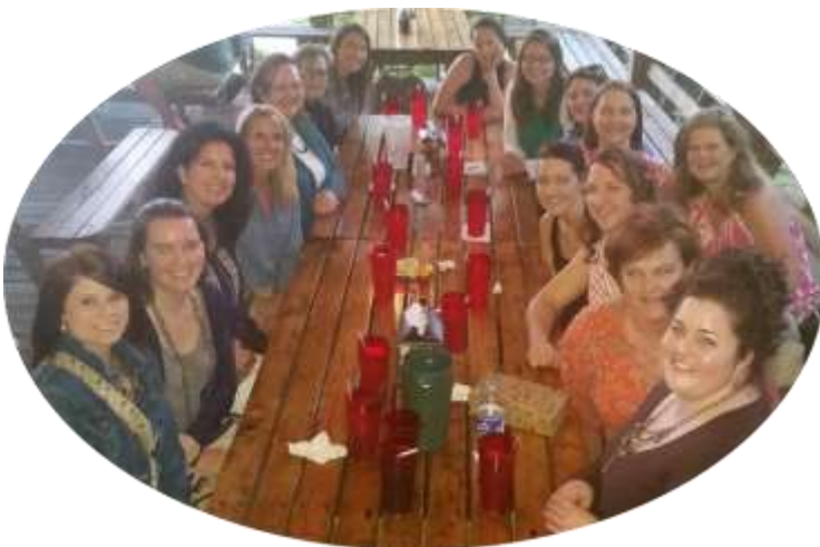
Wic at Night at Proffitt's Porch