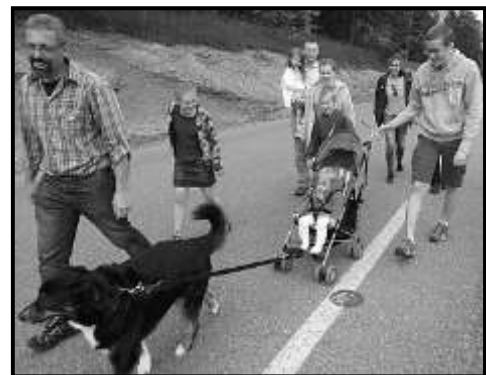
Dog-powered strollers are useful in the Alps