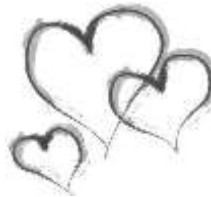
Behind the scenes at Happy Hearts.