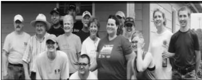
Brewer Group Habitat House