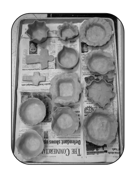
A small sample of the items created – more to come in the next newsletter