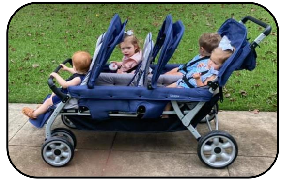
Check out our new ride!