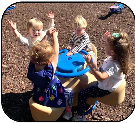
The playground is so much better with friends!