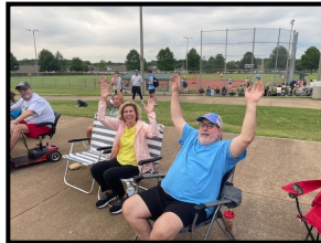
Excited Maples fans doing the "wave" cheering on the team!!