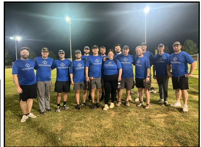
2024 Maples Men's Softball Team

There are only 3 games remaining this season: Tuesday, June 4, 7:40 p.m., on field 10, and then a double header on Thursday, June 6, 6:30 p.m. on field 11 and the final game of the year will be at 7:40 p.m., on field 12.