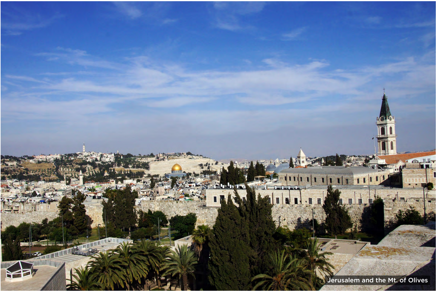
Jerusalem and the Mt. of Olives