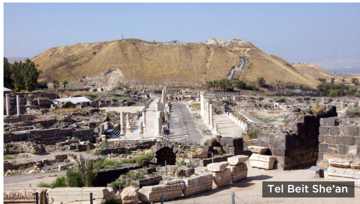
Tel Beit She'an