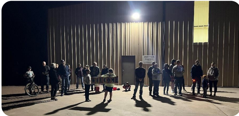
Our team ready to welcome and thank God for His new . . . . .

Well, I think this letter has gotten long enough. But I just need to teel you about one more huge blessing that arrived here in McNeal....yep!....the second helicopter for Papua New Guinea. Fresh from the factory!