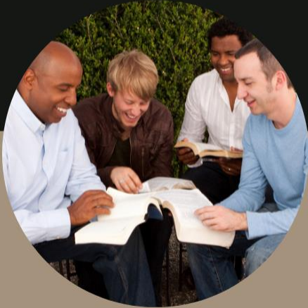
FELLOWSHIP & PRAYER