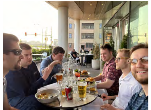
(right) Summer social event with Logos members.