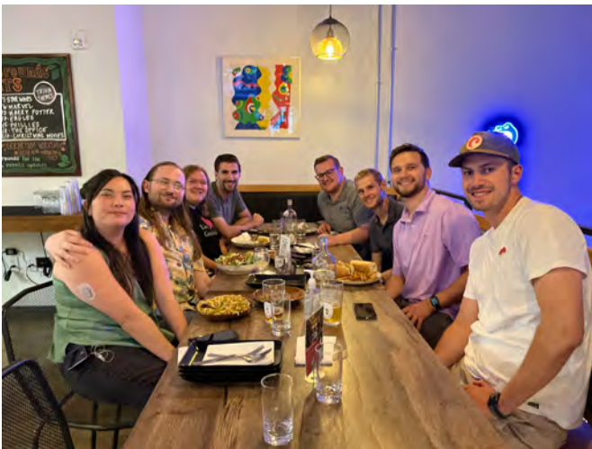
(above) Friends and members of Logos Lutheran meet for dinner in Philadelphia.