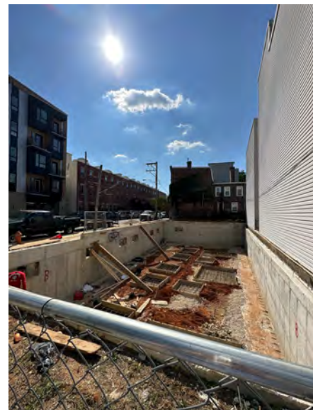
(left) New construction across the street from the Kieselowsky house.