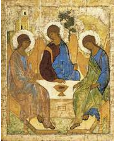
Old Testament Trinity icon by Andrey Rublev , Russian, 15 th cent. An illustration of Genesis 18

From “ The Creed of Saint Athanasius ,” 5 th century