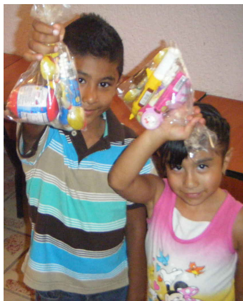
Serving in Guadalajara, Mexico.

Most of us take for granted the water which flows freely from our taps. But for many villages in South Asia, this basic life necessity is often in short supply. Village wells may dry up—especially during drought season—and it is not unusual for families to walk several miles just to find water for their household needs. If you are a Dalit, one of Asia's "Untouchables," you will likely be barred from drawing water from the village well at all because of your inferior social status. And Christians suffer too, as persecution commonly comes in the form of banning them from the local water source. This year we were able to provide two more wells through Gospel for Asia, which makes a total of 52 wells that has been provided through the church over the last 6 years. The wells not only provide a source of water, but helps point people to the Living Water. Also this year we have been able to help support local staff at GFA with $2,750.