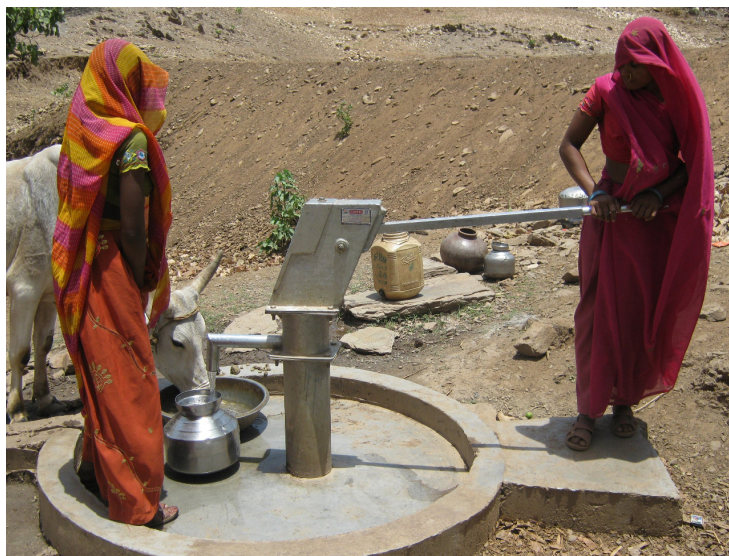
The Ridge Church has provided 52 wells over the last 6 years.

Most of us take for granted the water which flows freely from our taps. But for many villages in South Asia, this basic life necessity is often in short supply. Village wells may dry up—especially during drought season—and it is not unusual for families to walk several miles just to find water for their household needs. If you are a Dalit, one of Asia's "Untouchables," you will likely be barred from drawing water from the village well at all because of your inferior social status. And Christians suffer too, as persecution commonly comes in the form of banning them from the local water source. This year we were able to provide two more wells through Gospel for Asia, which makes a total of 52 wells that has been provided through the church over the last 6 years. The wells not only provide a source of water, but helps point people to the Living Water. Also this year we have been able to help support local staff at GFA with $2,750.