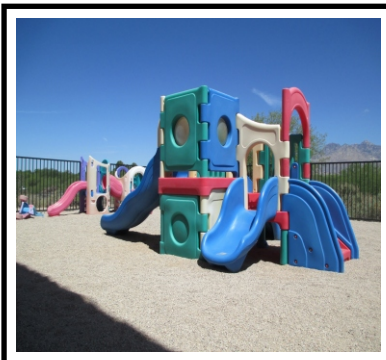
New playground behind nursery area