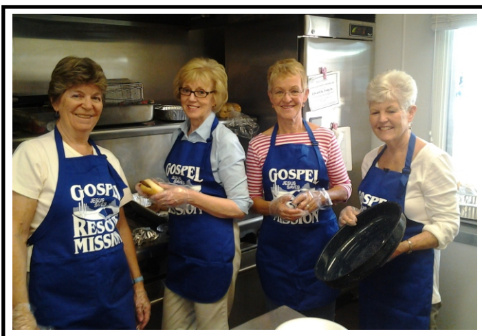
Rincon ladies offer joyful service at the celebration of Gospel Rescue Mission's 60th anniversary.