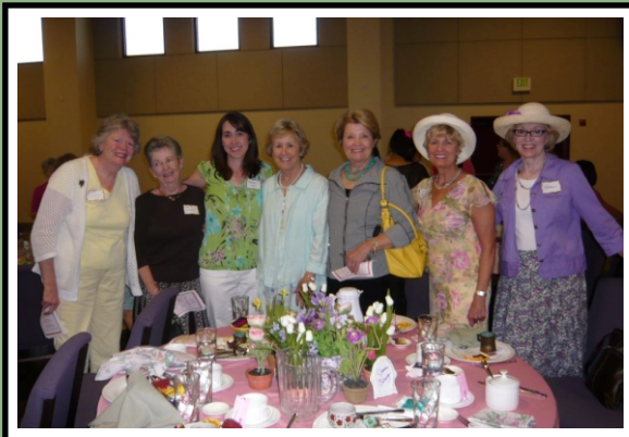
Rincon ladies enjoying fellowship at the Spring Tea.