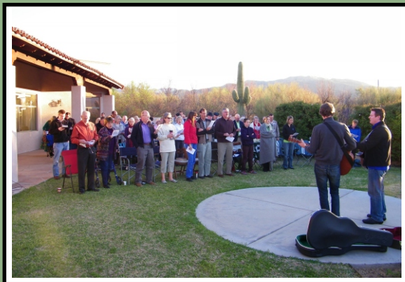
Joyful worship at Rincon's Annual Easter Sunrise Service