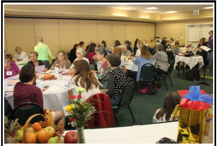
A room full of God stories

“Refined by Fire, Restored to Hope” was the theme of this year's Women's Retreat. On October 4 th and 5 th , sixty women gathered at the beautiful Windmill Inn at St. Philip's Plaza for a weekend of fellowship and renewal. The women enjoyed delicious food, uplifting worship in song, encouragement from testimonies of hope, and meaningful moments of vulnerability as they shared about their struggles.