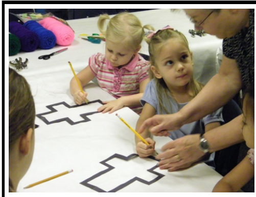
Making stained glass crosses at craft time.

We can celebrate that over forty of the children who attended this year are not affiliated with our congregation and that we started some great relationships. We can also be proud that our entire congregation faithfully supported the week through donations, supply preparation, and logistical help. We would like to extend a special thanks to the forty-eight youth and adults who served the kids directly throughout the week. We have and will continue to follow up with new friends that we made at VBS though emails and personal phone calls. Thanks again to everyone who helped make VBS a great success. You were a blessing to our congregation and to the kids!