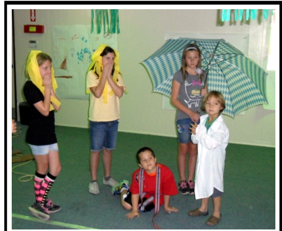
Acting out the story of Daniel in the lions' den.