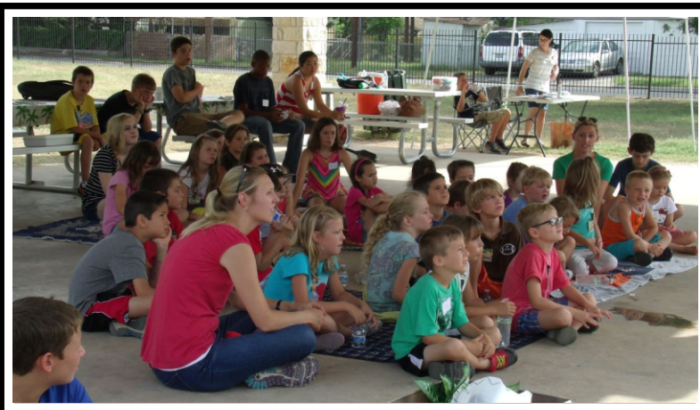
A great turn out for VBS at Pickrell Park in San Antonio.