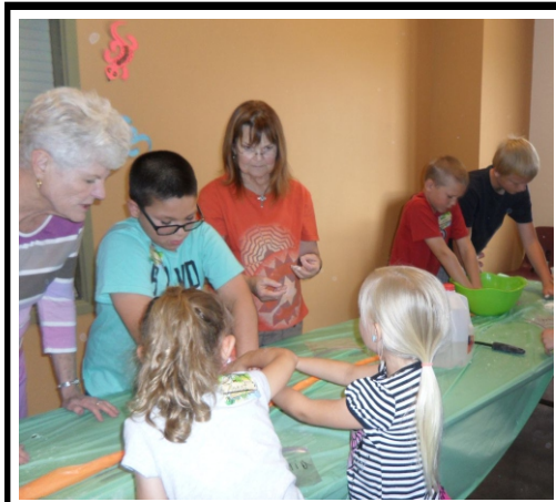
Having fun at craft time.