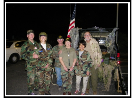
The winning trunk, created by the Collins and Bunches!