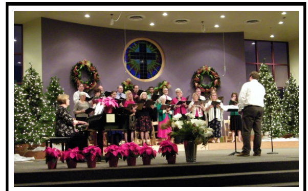
The RMPC choir rejoicing in Christmas song.