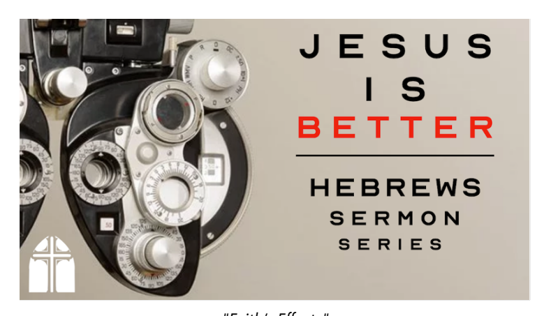
"Faith's Effects" Hebrews 11:7