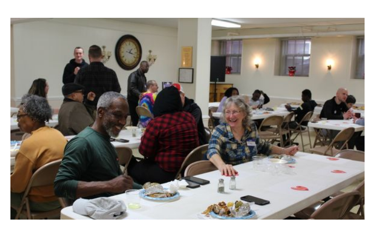
No Walls Second Saturday Picnic June 10, 12:00 pm - 2:00 pm Gospel Community Church at College Hill

Join us for a bring-your-own-lunch at Riverfront Park (the grassy spot near Waterstone downtown) for food and fellowship. Feel free to bring a ball or frisbee to kick/toss around!