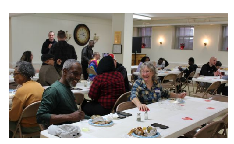
No Walls Second Saturday Picnic June 10, 12:00 pm - 2:00 pm Gospel Community Church at College Hill

Join us for a bring-your-own-lunch at Riverfront Park (the grassy spot near Waterstone downtown) for food and fellowship. Feel free to bring a ball or frisbee to kick/toss around!