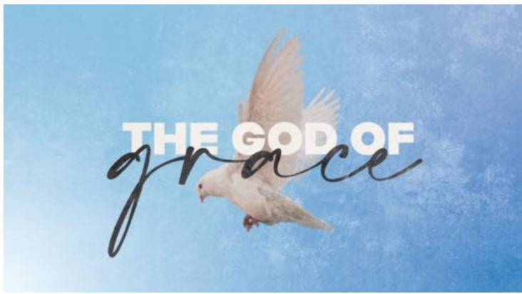
"Grace Frees Us" Galatians 5:1-6 (page 974)