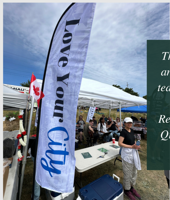
The music and vision team at the Royal Regatta on Quidi Vidi Lake

It was a great day, from 9am - 7pm, of giving back and loving our city. We had a lot of interest in Route 10's soccer camp and a number of people took information.