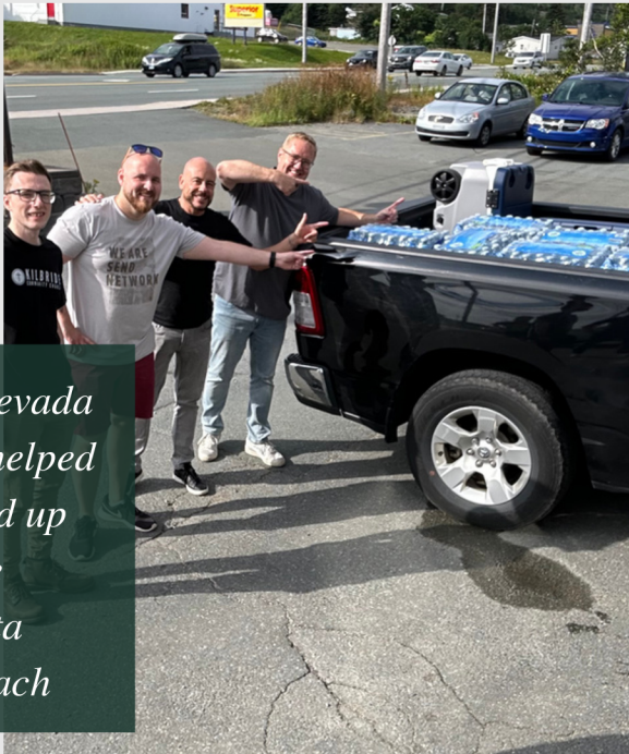
The Nevada crew helped us load up for the Regatta Outreach