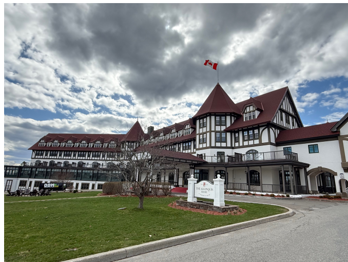
The Algonquin Resort