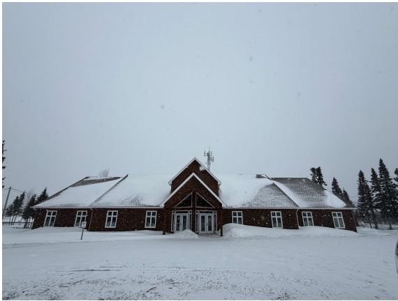
Early in April