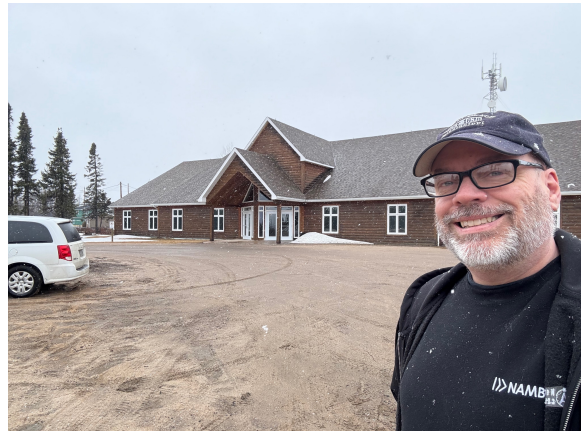
End of April

Spring in Labrador is a little different than regions south of us in that the snow begins to melt, but unless the frost under the soil is melted we end up with rather large mud puddles. Our church parking lot is not paved, but usually the large puddles only last a week or two at most. We put away the snow shovels and cleaned up the lawnmower!