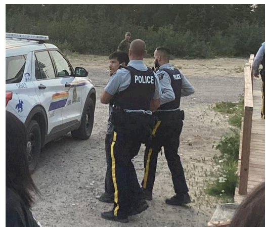
The primary suspect was arrested near my residence