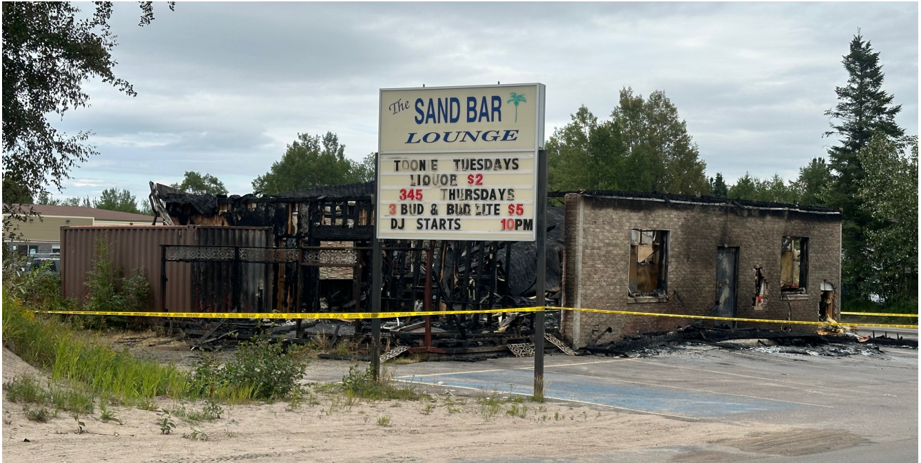
The Sand Bar Lounge (down the street from the church)

A marked increase in crime has many in the Happy Valley-Goose Bay community on edge, particularly with the increases with vandalism and arson. The Sand Bar Lounge is just down the street from Northern Cross Community Church and was burned about two weeks ago. A few days later a protest in front of the town hall resulted in city leadership committing to resolving the problems quickly. Fortunately a suspect was arrested in the arson and he is suspected in multiple other incidents involving vandalism and theft of nearby businesses to NCCC.