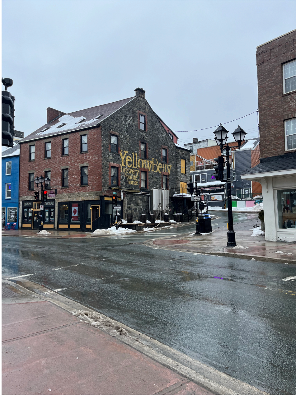
A rainy day downtown.