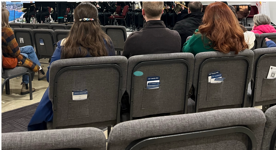
Regiment Band Concert