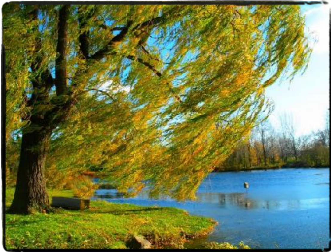
GOD'S WILL "A tree planted by water"