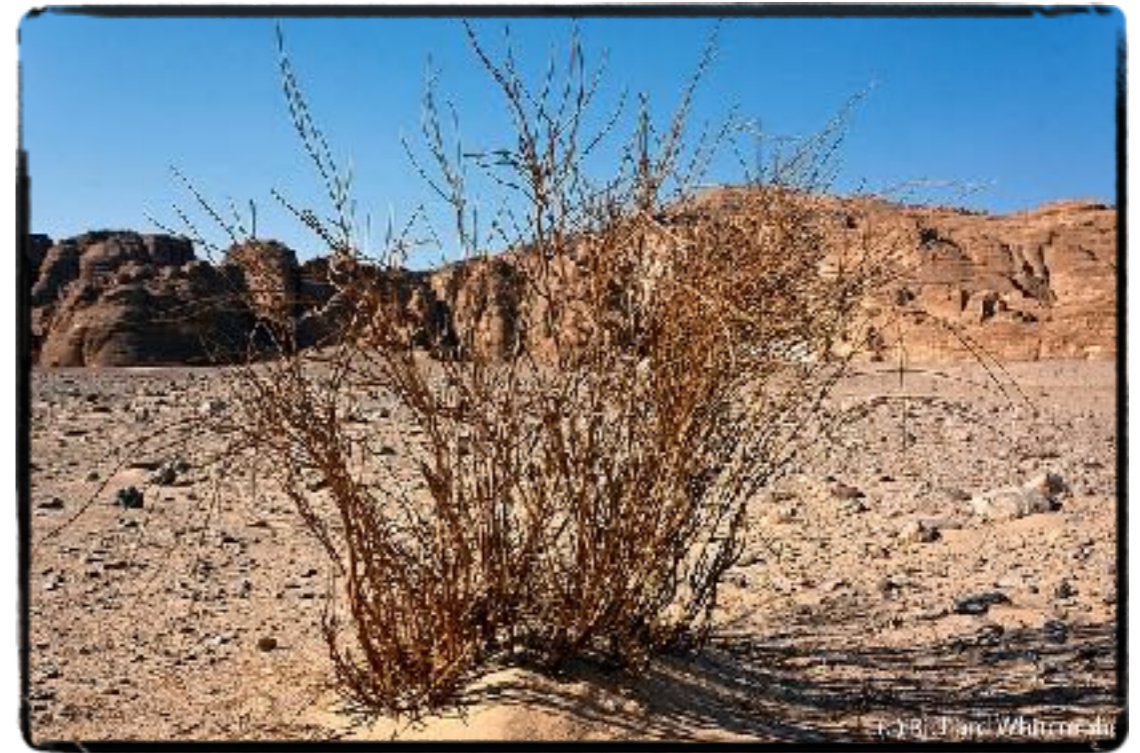
SELF-WILL "A bush in the desert"