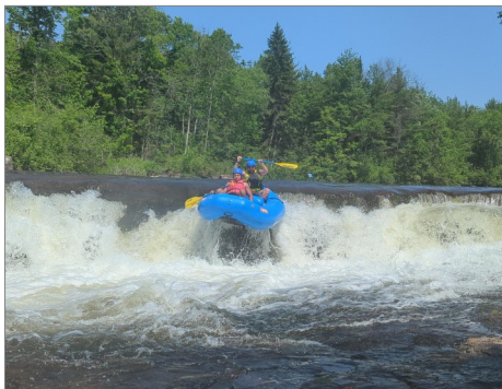
In June, we took 3 students/leaders from our Timber Bay area on our Wolf River rafting trip.