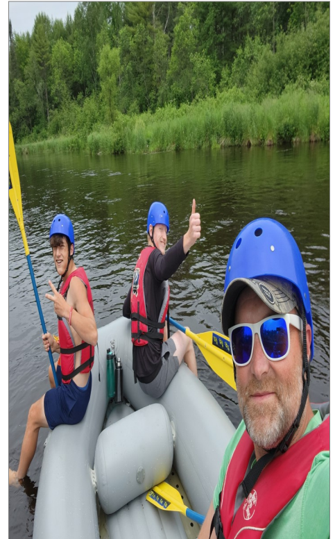
3 guys enjoying the Wolf River together ☺