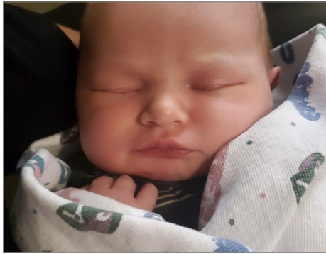
I recently became a GRANDPA! This is my granddaughter...)