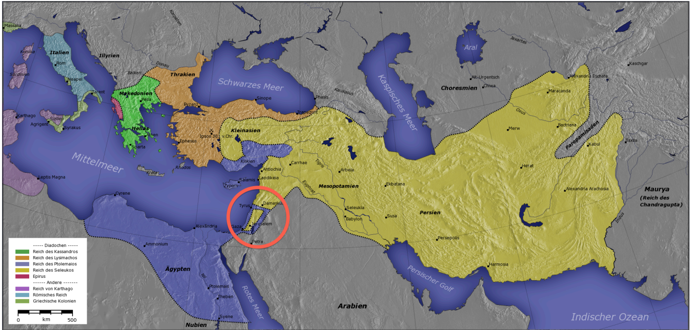
The division of Alexander the Great's empire into four kingdoms showing the area of struggle between the Seleucids and the Ptolemies