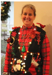
Third Sunday of Advent Ugly Sweater Sunday December 12th

Continue our advent fun by showing off your ugliest Christmas sweater on the 3rd Sunday of Advent!