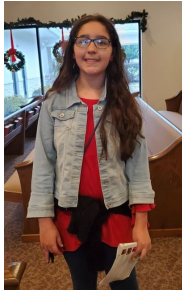
First Sunday of Advent Denim Sunday