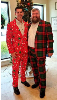
Second Sunday of Advent Classy Christmas Colors