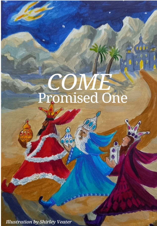
Illustration by Shirley Veater

Advent Devotionals are here! Scan the Qr Code to order or pick one up on December 1st at the Advent Wreath Workshop.