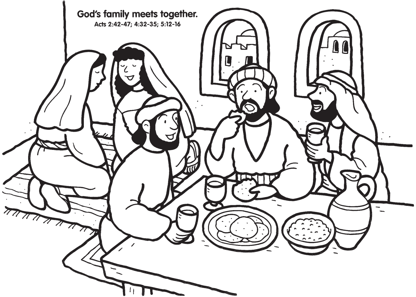
© 2007 Gospel Light. Permission to photocopy granted to original purchaser only, The Really Big Book of Bible Story Coloring Pages • 277