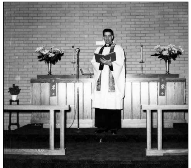
Pictures from "The Stones Will Shout: Celebrating 100 Yersars of God's Grace"

We hear and are comforted by the promise of Christ, our Lord: "I am the resurrection and the life. Whoever believes in me, though he die, yet shall he live, and everyone who lives and believes in me shall never die" (John 11:25-26).