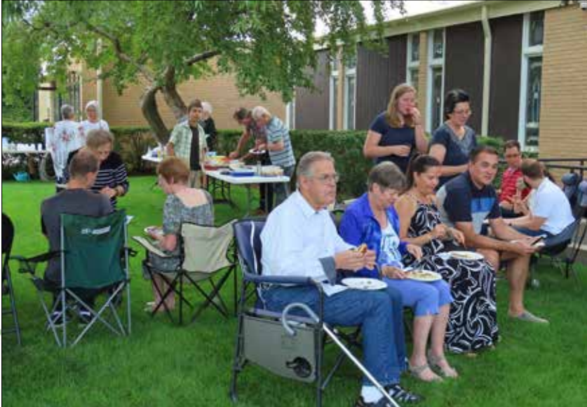
A sampling of photos taken.