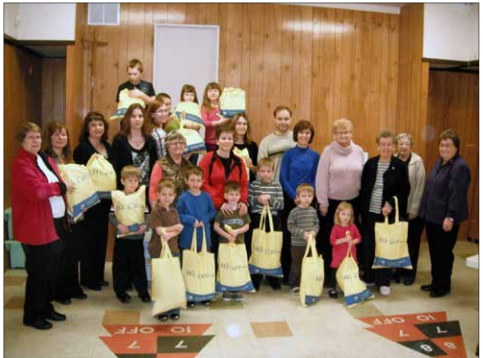
Packing We Care bags for Canadian Lutheran World Relief brought children and adults together for a fun service project.

fruits that go to the church, but extra coins and bills that are collected as “mites.” The term itself comes from the King James Version story of the widow who gave a mite, all that she had. In newer versions the text speaks of two copper coins so the word mite has become less familiar.