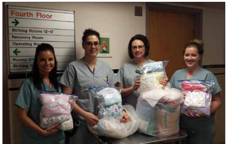
Nurses on Maternity at Royal University Hospital were most appreciative of the layettes we provided each year.