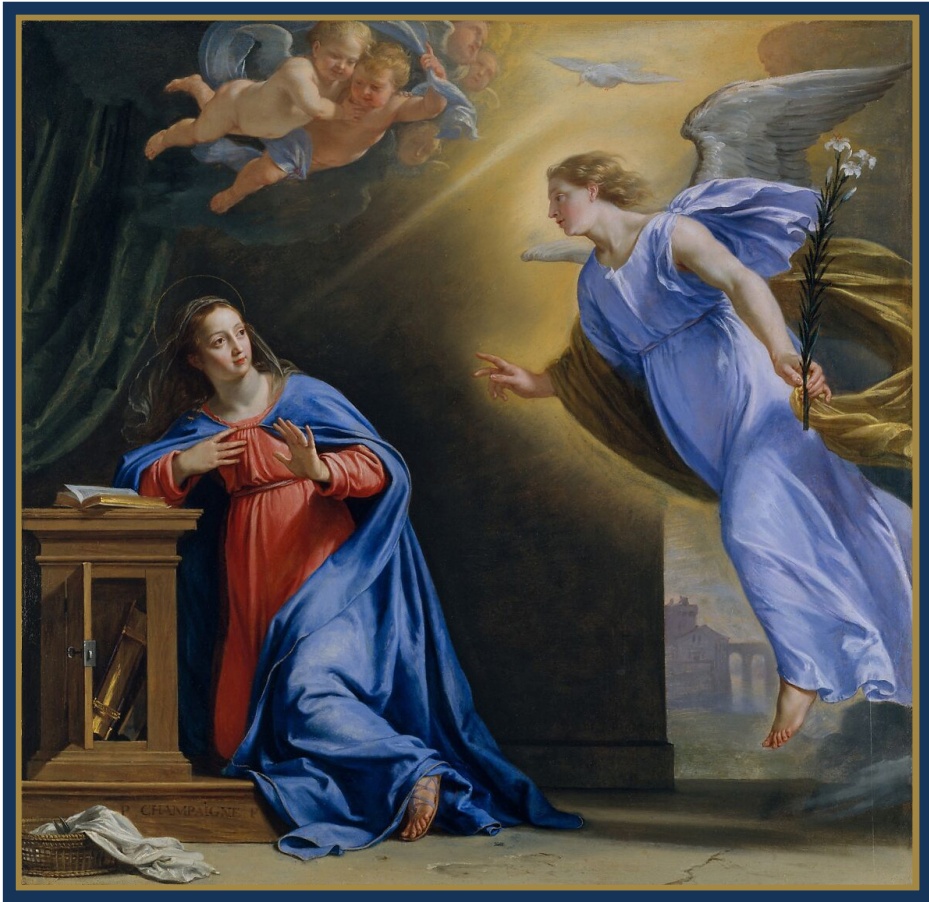
The Annunciation, by Philippe de Champaigne (1602-1674)