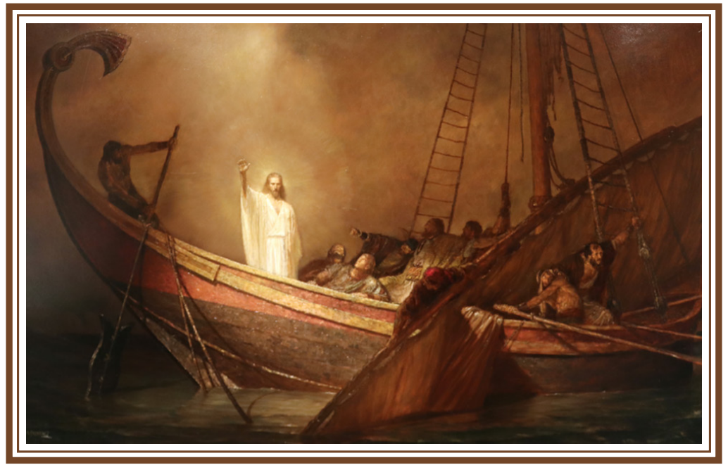
Friberg, Arnold (1913–2010). Peace, Be Still (date unknown). BYU Museum of Art. Provo, UT.