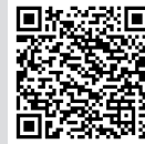
Blood Drive September 26