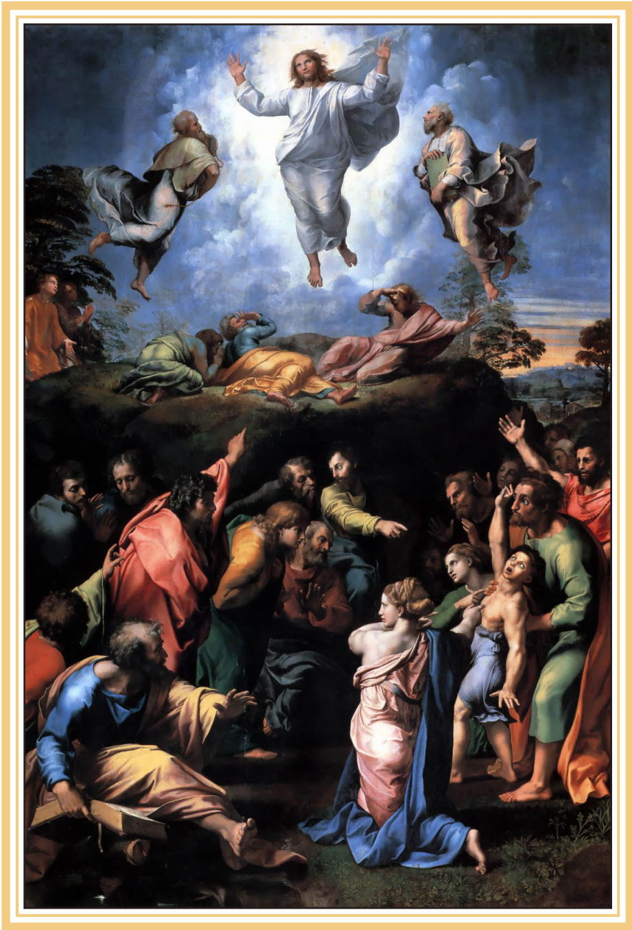
The Transfiguration by Raphael (1520), oil tempera on wood. Pinacoteca Vaticana, Vatican City.