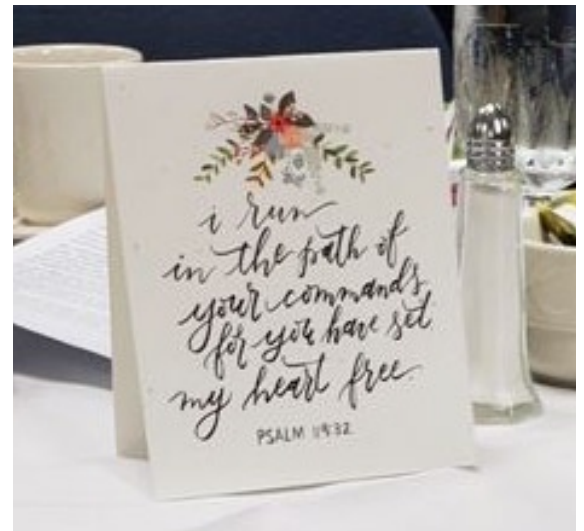
Tables at the ladies luncheon were decorated with scripture cards; ladies were served a lunch of salad with grilled chicken.

The breakfast and prayer time ended on a light note, with the pink Gerbera daisy center pieces being given away to those who had traveled the farthest or the shortest distance to the convention, or been to the most or fewest conventions.